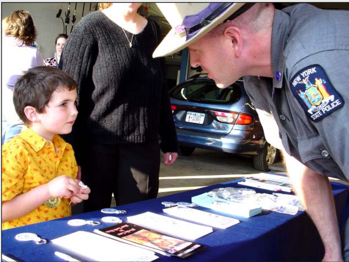
Hundreds enjoyed great weather, a few snacks and the sparkling new OA Transportation Facility May 5. To see more photos from that day, see Page 8.