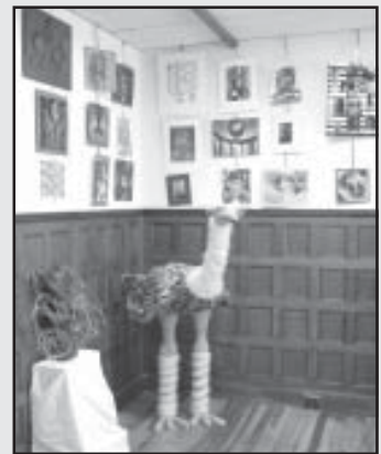
ART EXHIBIT - The OFA AP Art Show went on display June 1 and will remain through the end of the month at the Tioga Council of the Arts Gallery, 179 Front St., Owego. The show, entitled "30 Weeks," is open 10 a.m. to 5 p.m. Mondays through Fridays. The photo above gives a glimpse at some of the work on display.