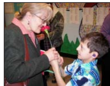
Many of the grandchildren at AES presented their grandmothers with a carnation on April 28.