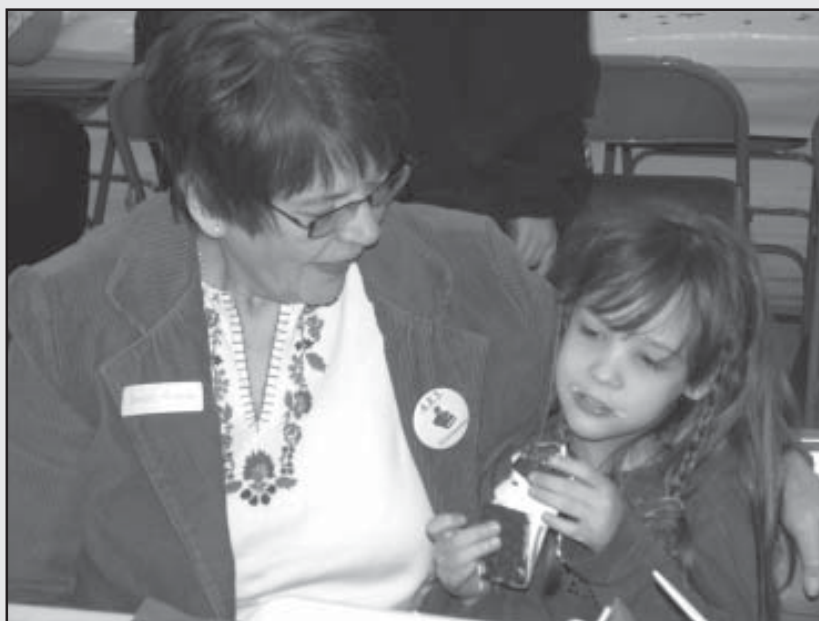
About 370 grandparents visited AES on April 28. Pictured here are just a handful of the moments from that day - some serious, some silly - as students got to show their grandmas and grandpas (some moms and dads, too) around their school.