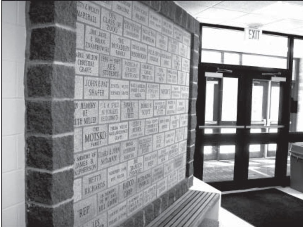
The wall of bricks outside the OA Pool exemplifies the level of community support that was behind the facility's construction.