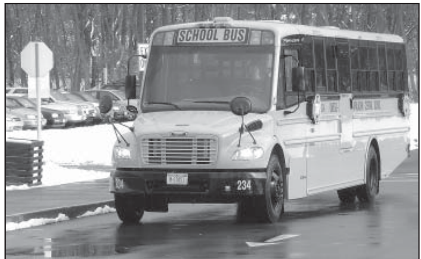
The OA district is proposing to purchase four new buses this year, similar to the bus pictured in the two photos above.

The district attempts to replace buses on a 10-year cycle, or at a time when maintenance fails to become cost-effective.