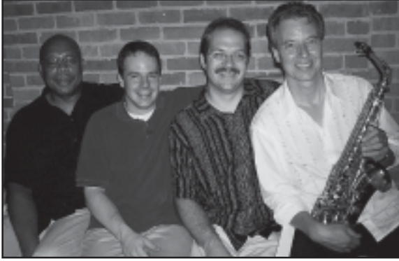
From the Miles Ahead Web site